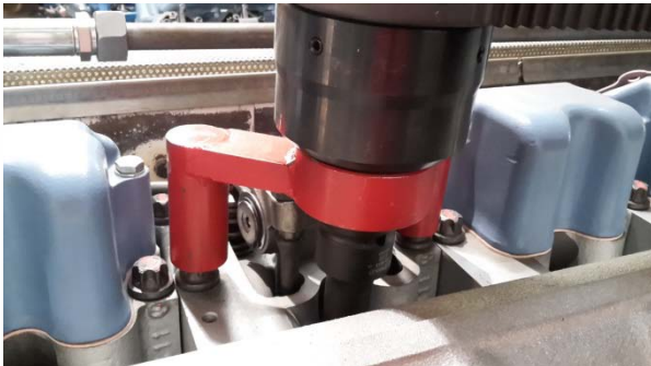
Abbildung 5: Special Y Support

The “old“ MAN engines, due to the heater plug, have a by 80mm lowered bolt. Thus, not all bolts are level. To open the bolt in front of the heater plug an additional special Y support next to the special sliding support is required. The special sliding support is used for the remaining bolts.