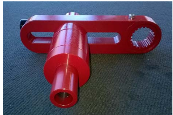
Figure 3: Special Sliding Support