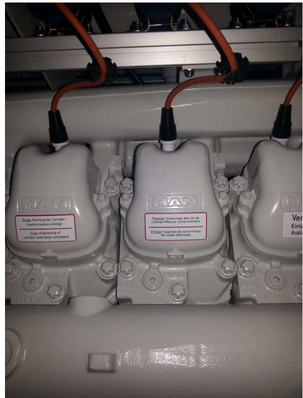
Figure 1: MAN Motor

The old MAN engines require a torque of 80 Nm – 100 Nm + 90° + 90° + after 1000 km 90°, in several steps. The new engines require a torque of 300 Nm + 90° + 90° + 90°.