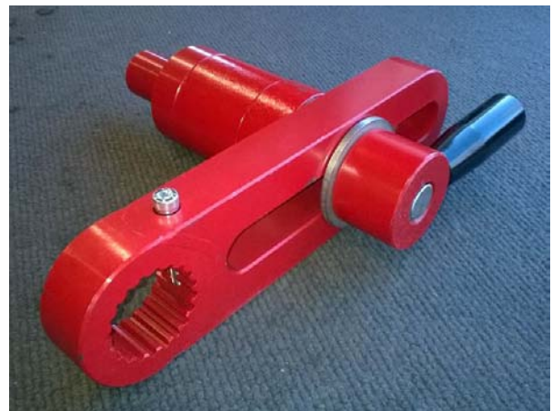
Figure 4: Special Sliding Support